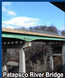
Patapsco River Bridge